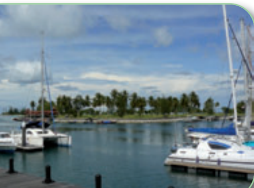
A small marina, very few boats... Malaysia awaits you!

Finally, note that Langkawi is also a stopover renowned for its