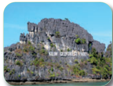
Langkawi is a natural paradise which became a UNESCO 'Geopark' in 2007.

The ideal thing is to sail at Langkawi between November and April, as the winds, generally from the north-east (between 5 and 20 knots), are more favourable. And here, shield your eyes! Small anchorages in superb creeks bordered by immaculate white sand, and swimming in the middle of a multitude of fish are yours for the choosing... Distances between anchorages are very small, encouraging you to discover